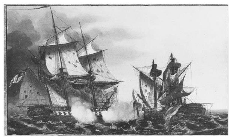
The Oct. 25, 1812, battle between the United States, commanded by Capt. Stephen Decatur, and the British warship Macedonian. The Macedonian was brought into Newport and repaired and later commissioned in the U.S. Navy.

All was not well within the Navy, however. The British continued to impress American sailors — kidnapping them from their ships and forcing them to serve the crown. The most egregious offense came in 1807, when the British frigate Leopard confronted Chesapeake , an American frigate, and took three men. The American Commodore James Barron did not mount much of a defense. Adding to the insult of the impressments, the British refused to accept his surrender of the ship. That meant Barron had been completely dishonored, as he couldn't even claim the loss occurred during a legitimate battle. Decatur served on his court-martial, and Barron was discharged from the Navy for five years. Barron never forgot the insult.