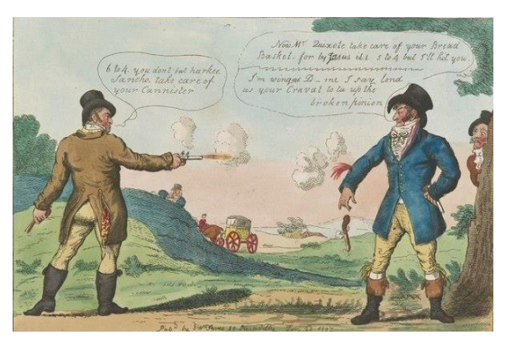
"The slang duellist's a shot at a hawke or the wounded pigeon!" by Isaac Cruikshank, published by S.W. Fores, 50 Piccadilly, Jun. 20 1807.

By 1800, the Navy was losing many men to duels, two-thirds as many as were lost in sea battles. The Code Duello set forth the rules for dueling on the Continent and in America.