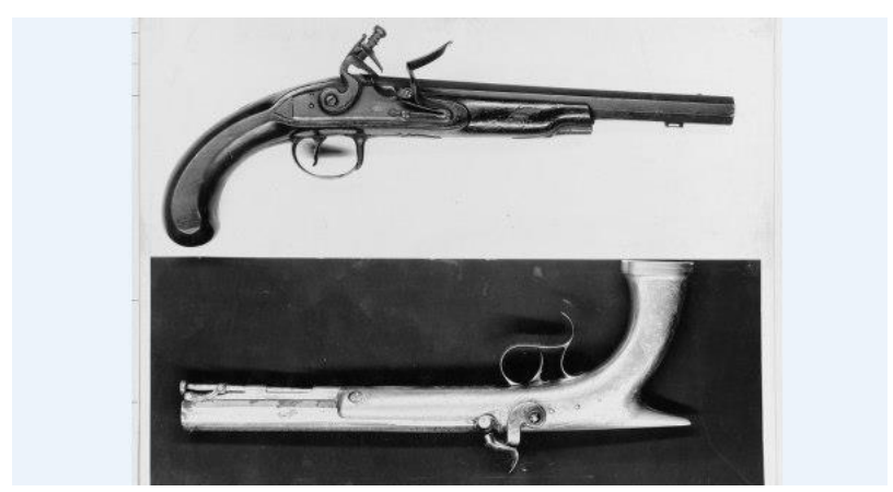
A pair of pistols in the Decatur House said to have been used by Commodore Stephen Decatur in the duel in which he was killed, 1820.

Dueling was banned in the District of Columbia, so residents of the young nation's capital generally went to Maryland, usually to the fields of Bladensburg, to duel. At the time, dying in a duel was unlikely. Flintlock pistols often misfired, and a misfire was considered a shot. Even when they did fire, accuracy was a problem with the smoothbore pistols. The duel Decatur and Barron fought required each man to aim before the duel began. Decatur announced his intention merely to wound Barron. The seconds measured the distance and loaded the pistols.